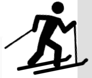
Tourism Map Pocahontas Ski Area Development & Tourism

The best of walking, tubing, snow, the soft perfect snow, walking through a forest of tall spruce and fir trees, the quiet peace and tranquility of a winter day. There are many trails to choose from, each with its own unique character. Some are for cross-country skiing, some are for snowshoeing, and some are for walking. The trails are well marked and easy to follow. The snow is soft and deep, making it a perfect environment for winter recreation.